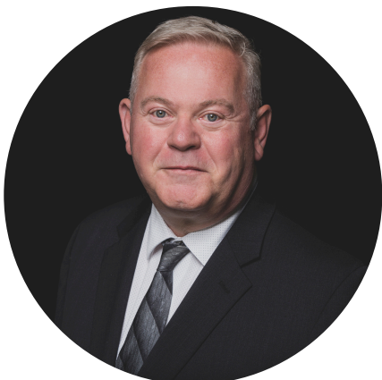
Mayor Doug Glasser

Is there a hobby you've always wanted to try? I've lately been interested in trying curling.